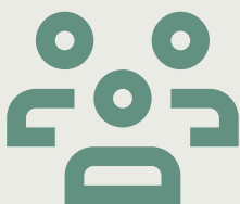
Community and welfare services