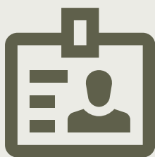
Administration of facilities