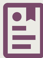
Governance and administration services

Where we are directly responsible for an activity and resources permit, we are committed to delivering the aspirations set out in the Community Plan. Where we do not have direct responsibility or influence on the aspirations, we will advocate to those responsible and will work in partnership with them to deliver outcomes for the Shire of Nannup and its residents.