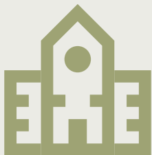
Community infrastructure and asset management

The roles and responsibilities of the Shire of Nannup include: