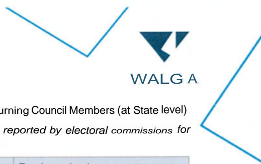
Table 3: Percentage of all elected candidates who were returning Council Members (at State level)

States with full spills only Official state level percentage reported by electoral commissions for elections they conducted