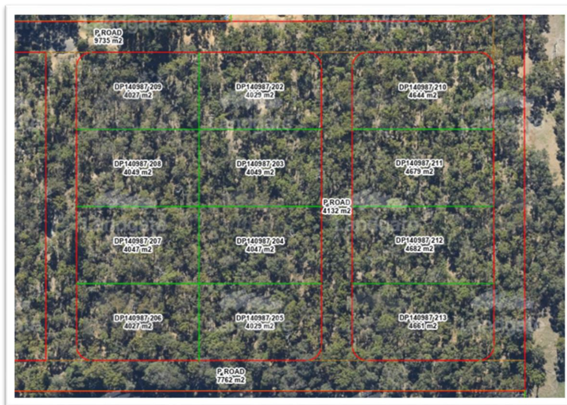
Figure 7 – Option 1 – current 12 lots