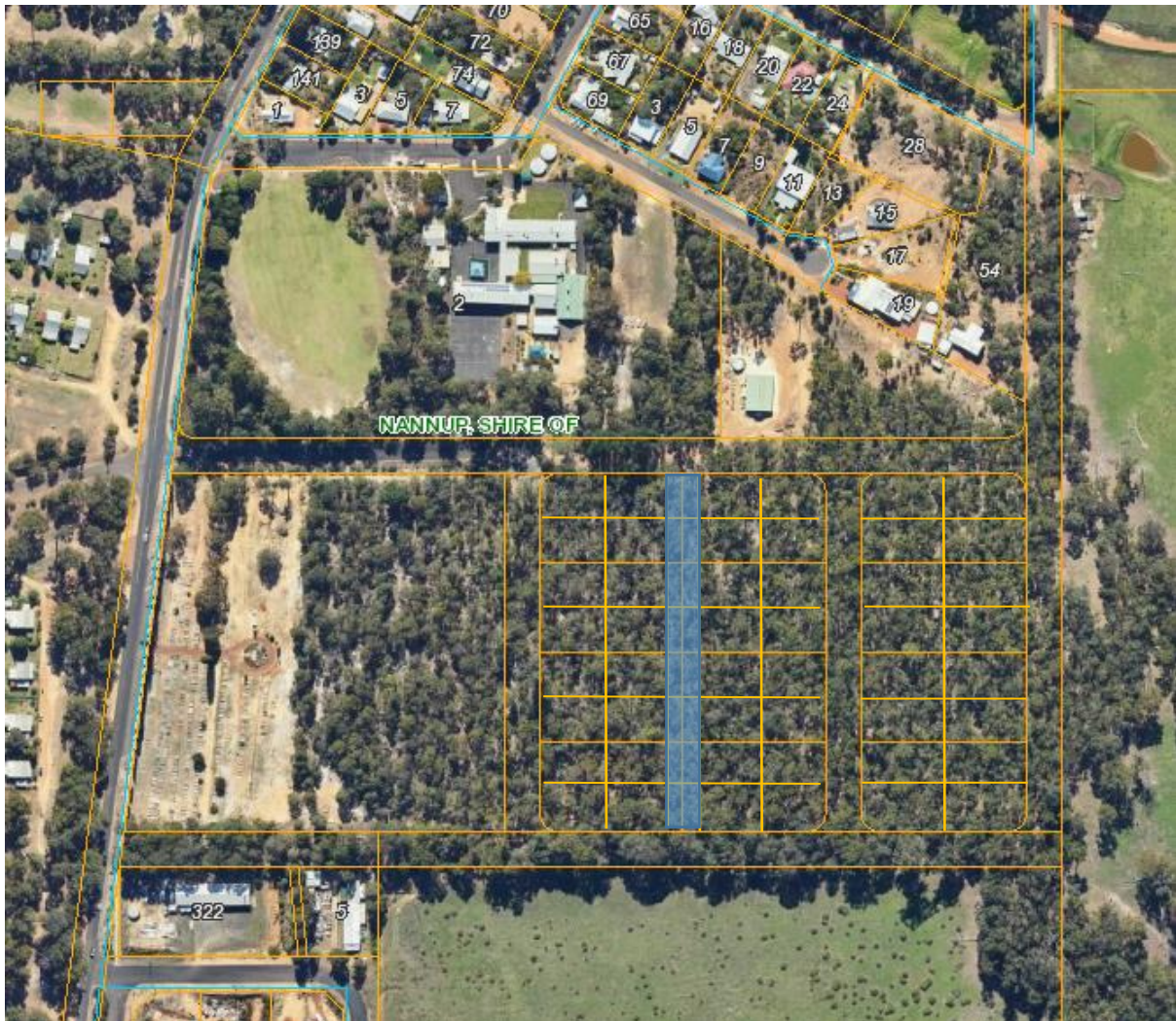
Figure 8 – Option 12 – Redesign to 48 lots