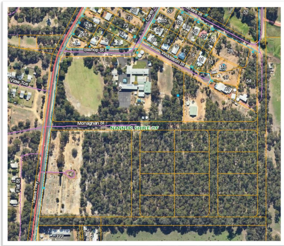
Figure 5 – Current Reticulated Water Supply