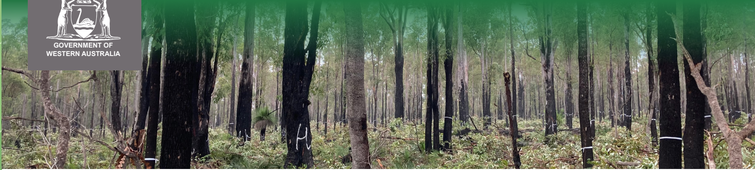
Munro trial site after thinning.

Selection of specific locations for thinning will involve assessing observed and projected changes in rainfall, groundwater trends, forest condition and potential habitat for threatened species. Any proposed thinning will also need to ensure protection of value of the land to Aboriginal culture and heritage.