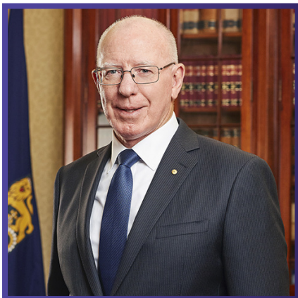
HIS EXCELLENCY GENERAL THE HONOURABLE DAVID HURLEY AC DSC (RETD)

Governor-General of the Commonwealth of Australia