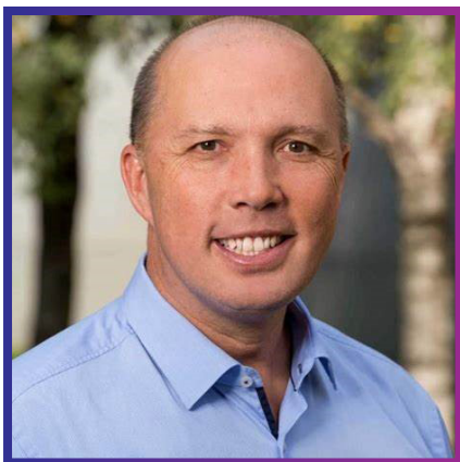
THE HON PETER DUTTON MP (INVITED)

Peter Dutton is the Federal Member for Dickson and Leader of the Liberal Party.