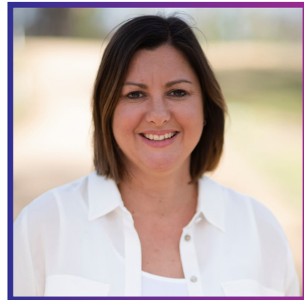
THE HON KRISTY MCBAIN MP