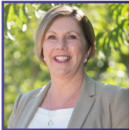
THE HON CATHERINE KING MP (INVITED)

He was awarded an Honorary Doctorate of Letters from the University of Wollongong in 2013; a Doctor of the University, honoris causa, from the University of New South Wales in 2015; made a Fellow of the Australian Academy of Technology and Engineering in 2016; and awarded an Honorary Doctorate from Macquarie University in 2017.