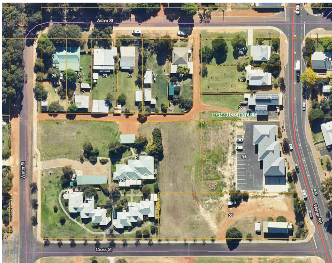
Figure 1 – potential senior housing precinct

Previous discussions have identified the area bounded by Warren Road, Cross Street, Walter Street and Adam Street illustrated below in Figure 1 as a potential senior housing precinct.