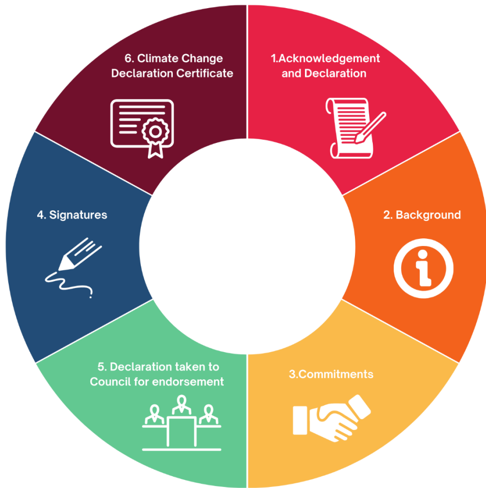
Figure 1: The Climate Change Declaration process