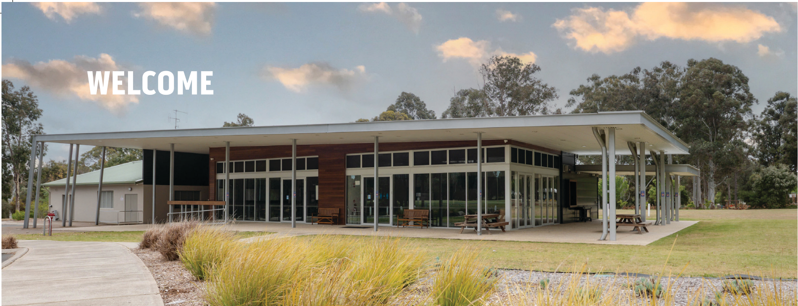
The project will investigate upgrading sporting and community facilities, tourism features, and housing options with a vision for a strong future in Nannup.

Welcome to the first edition of the quarterly Newsletter for the Shire of Nannup! Our aim is to keep you updated on the activities of the Shire, and there has been lots of activity in Nannup over recent years. With over $8 million in planned and delivered externally funded projects, we have been able to deliver a world class mountain bike park, improved road safety upgrades and many other projects that support vibrancy in Nannup.