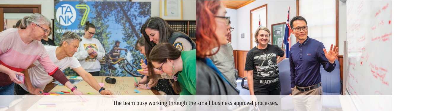
The team busy working through the small business approval processes.

It also formalised its event approvals process, streamlined and standardised application information, and created a visual guide of the approval process and application requirements.