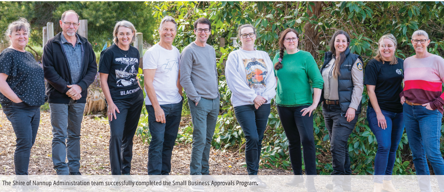
The Shire of Nannup Administration team successfully completed the Small Business Approvals Program.

As a result of participating in the Small Business Development Corporation's (SBDC) Small Business Friendly Approval Program in July 2022, the Shire of Nannup is now more equipped to help small businesses succeed in our community. The four-week program equipped our staff with the skills and knowledge needed to improve our systems and processes in order to better support small businesses.