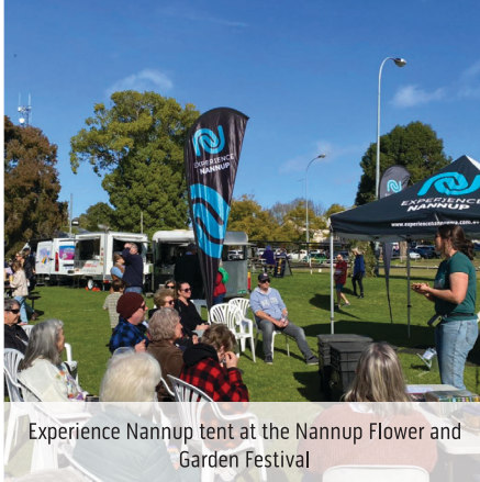
Experience Nannup tent at the Nannup Flower and Garden Festival

Disclaimer of Liability The Shire of Nannup cannot accept any responsibility or liability, whether direct or indirect, for any loss, damage, cost or expense that might be incurred as a result of the use of or reliance upon the materials which appear in this correspondence or any linked sites. A reader assumes full responsibility for any actions taken based on information obtained from this correspondence or linked sites.