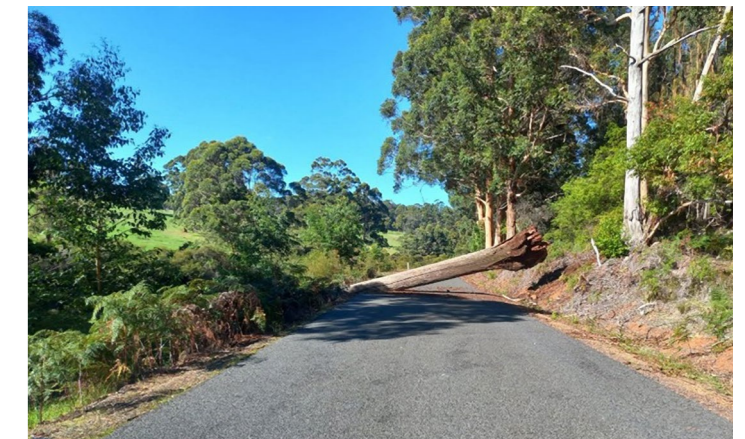
Fallen Tree East Nannup Road