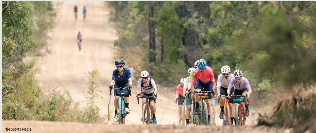
NM Sports Media

The past few months have been a particularly active period for the Shire of Nannup's events team. The full calendar has included mountain biking events, heritage tours, art trails and fundraisers, reflecting Nannup's growing presence as a regional event destination and its continued focus on economic development.