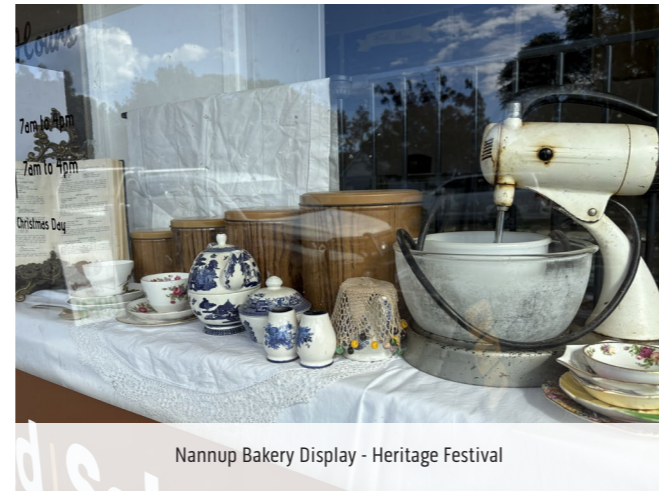
Nannup Bakery Display - Heritage Festival

In 2025, Nannup took part in the first Southern Forests and Valleys Heritage Festival—an event that is expected to become an annual feature in the region. The festival gave visitors a chance to explore local history through a variety of activities, including guided tours of the Nannup RSL ANZAC display, a self-guided trail of local military sites, and a closer look at the Nannup Bakery's transformation from pharmacy medicine to pastries.