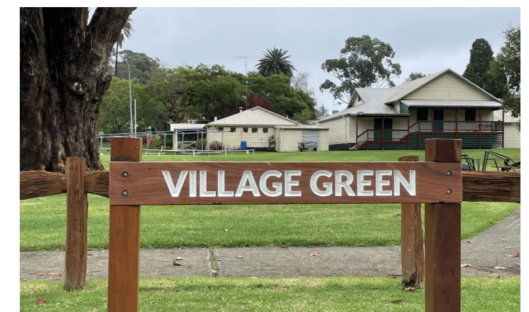
The new Village Green sign helping visitors easily identify the location